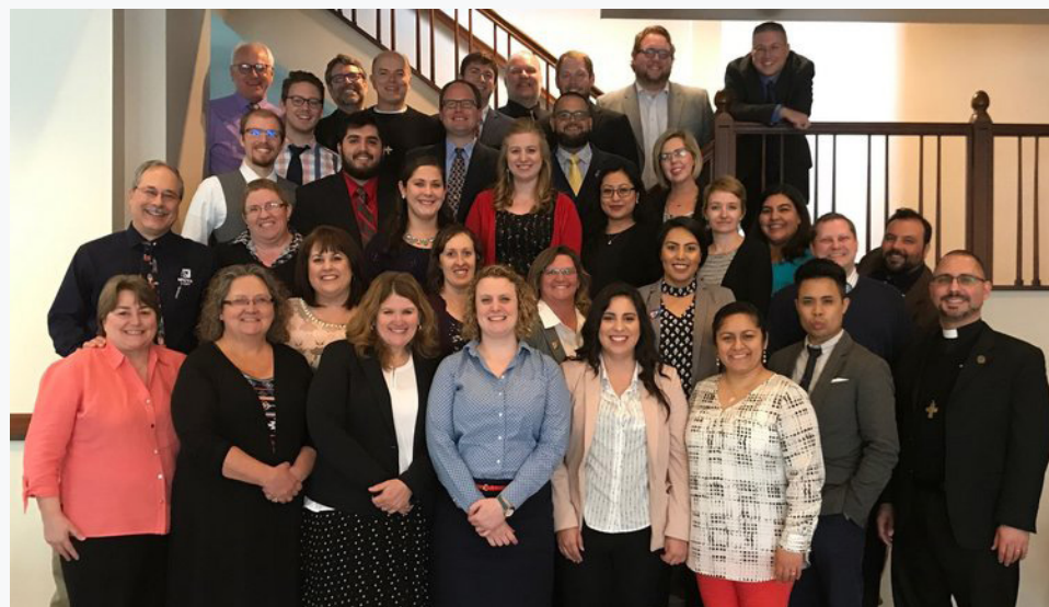
NDDI CLASS OF 2018

As part of its mission to educate, train, and support diocesan leadership, the National Federation for Catholic Youth Ministry sponsors, a New Diocesan Directors' Institute, (NDDI), an annual institute for new diocesan leaders in youth and young adult ministry. NDDI programming includes an introduction to national Catholic Church resources, training in management skills, insight into personal spiritual development, and ongoing visioning and planning.