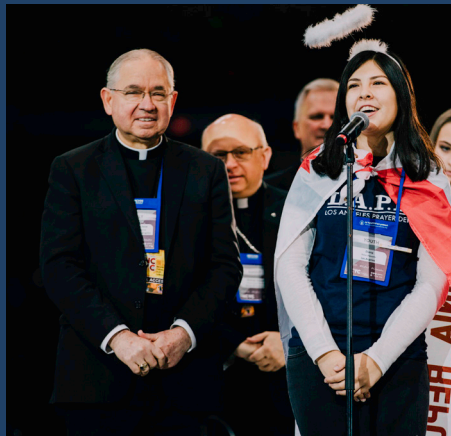
Most Reverend Jose H. Gomez, Archbishop of Los Angeles, at NCYC with a youth representative from Region 11.